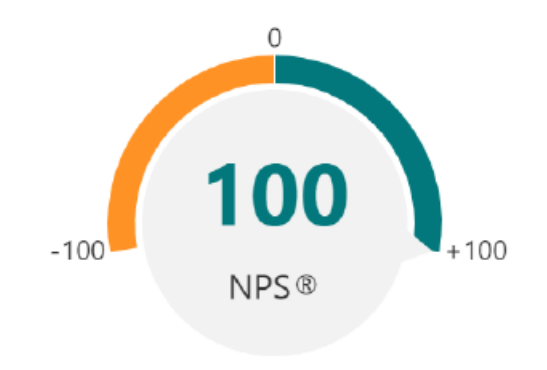
5 in attendance